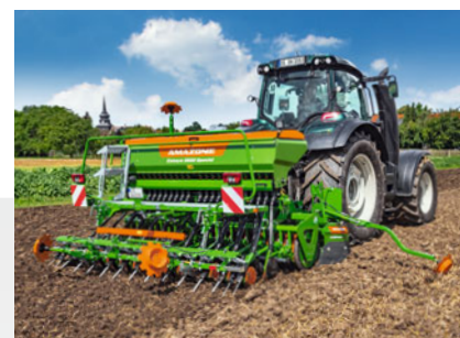
2016 The latest generation of the conventional sowing combination: the Cataya