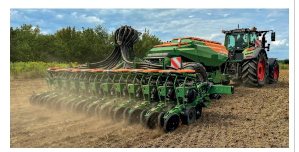
For rapeseed, we used a Precea 6000 TCC with the central seed hopper system. Each row unit was also equipped with the optional 8-litre box.

Beneath the seed hopper is a type of metering gate which meters the seeds pneumatically to the seeder units; these in turn have small 'intermediate' boxes that hold roughly two handfuls of seeds. By simple application of physical principles, the airflow to these boxes is cut the moment they are filled, so the seed flow is cut off, too. Yet, as the filling levels in these transparent boxes drop, the airflow is re-established and the boxes are topped up. No electronic control required.