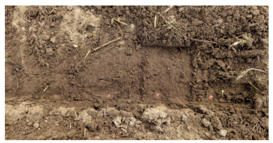
The Precea delivers outstanding seed placement accuracy. Seed depth and spacing are consistent.