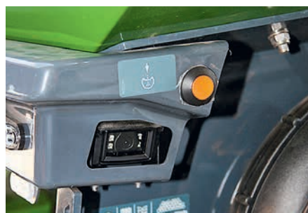
One of two side cameras is sited under the calibration button on the left of the machine.

The FTender comes in two sizes, 1,600 and 2,200 litres (the price difference is £1,915). Both hopper sizes can also be used with 3.0m and 4.0 wide combis, but are not pressurised for these smaller drill working widths. The