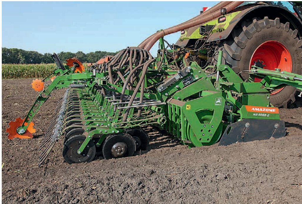
With the hydraulic coulter pressure adjustment, it's also possible to lift the seed coulter by 15cm.