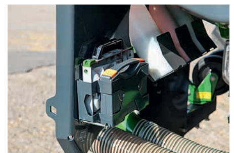
Less than ideal, the calibration kit is left out in the open in this bracket under the bin.

pressurised set-up is reserved for the higher seed volumes involved with feeding the two hoses and twin seed distributors on the 6.0m version. And looking beyond the featured cereal drilling combi, the FTender can also be employed for supplying fertiliser to a rear-mounted maize drill or other tillage tool. The electric-powered metering system has