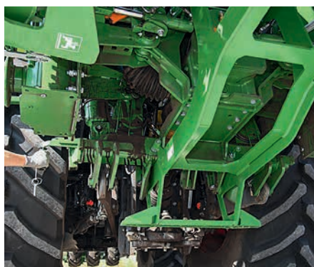
The transport kit can be removed in double-quick time, and, with a bit of skilled shunting, it can be attached almost as quickly.

models, and this is now mounted on the same parallelogram linkage as the packer, making it possible to have hydraulic depth control, as everything moves in unison. This £3,760 option was fitted to our test machine. The new linkage system also means Amazone has been able to include its QuickLink demount system for taking the drill off quickly.