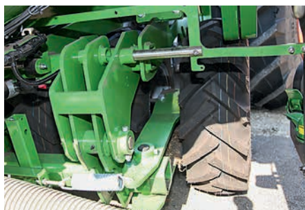
For transport, the packer can be raised off the deck and locked in position.