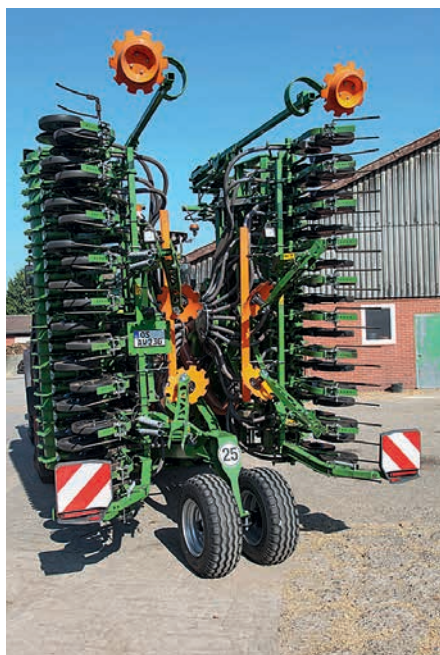
With a min rear weight of 5.5t, the optional running gear is recommended for transport.

So, what has changed to warrant the new model designation? Well, the 6.0m harrow has the tighter fitting side deflector plates as used on the 3.0m KG (see profi 5/2018 and profi 11/2019). It also shares the central adjustment system for the levelling board with the smaller