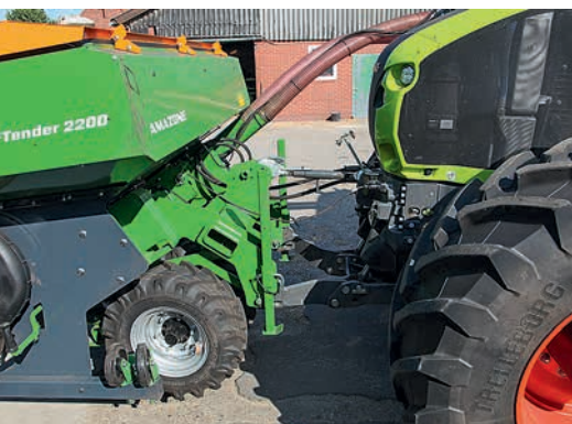
The tyre packer is bolted to the front tank, and it can also be removed to use as a front press.