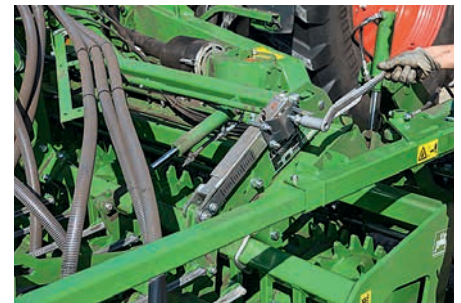
Also new is the seed depth control with the universal tool.