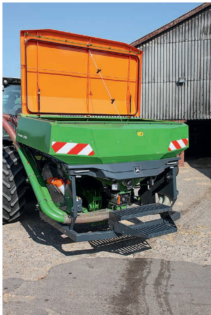
The metering system and pressurised hopper of the FTender 2200 are easy to access.

packer can be locked in its raised position enabling you to lower the front linkage by 25cm. Another useful extra is the camera system (one on each side of the hopper) and in-cab display. The £1,390 option has obvious benefits, and in Germany all manufacturers need to have these camera systems certified to prove they are up to meeting their safety responsibilities – this certification is currently pending for the Avant.