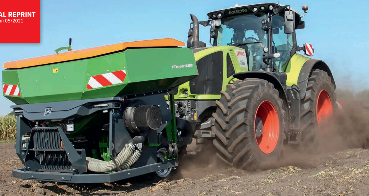
Amazone Avant 6002-2 power harrow drill: