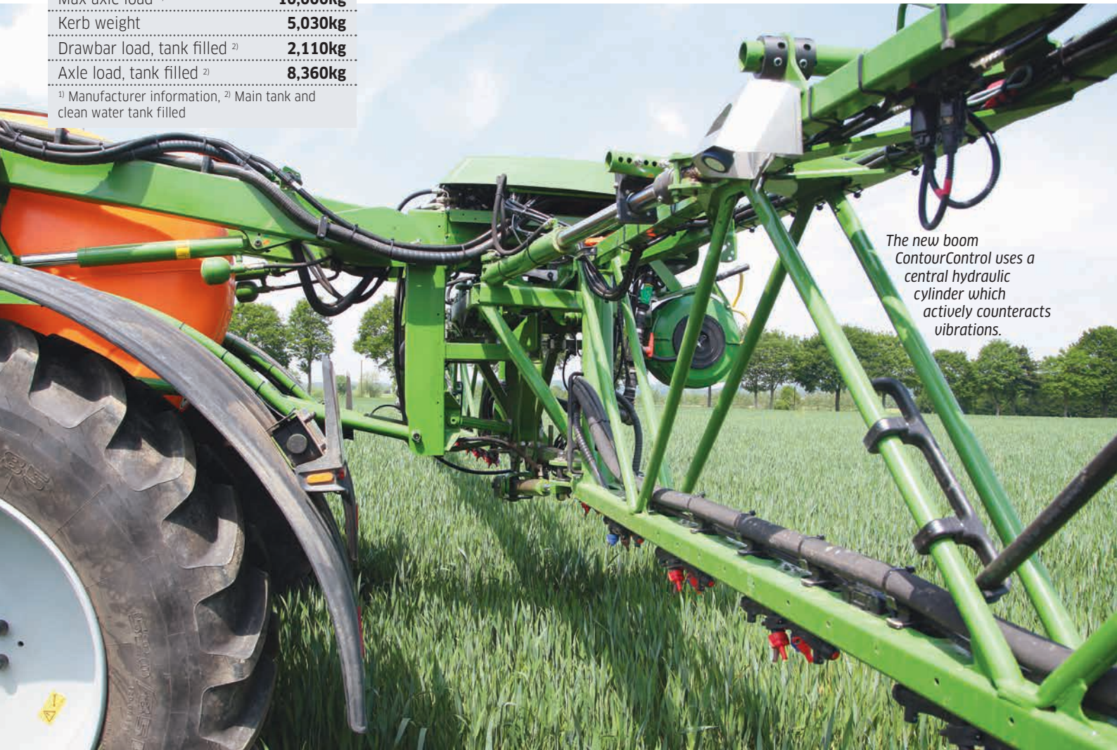
The new boom ContourControl uses a central hydraulic cylinder which actively counteracts vibrations.

Getting back to the test 4201. The GPS-controlled AmaSwitch individual nozzle control feature is not exactly chump change