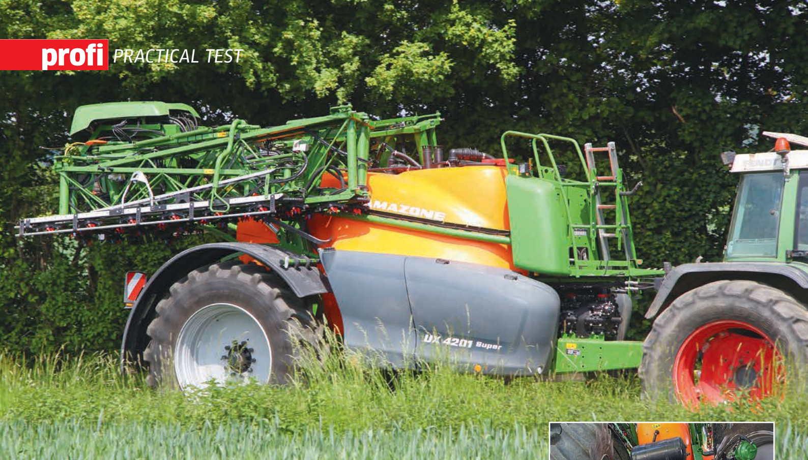
The Super L boom swiftly folds into a compact package. Load-sensing brakes and a 12.5t gross weight allow you to travel at 60km/hr even when filled with ammonium nitrate urea solution.

at £8,635 but is certainly recommendable. It allows operators to customise the number of manual sections and then have the 54 nozzles controlled by GPS. This worked really well, especially on corners. Our test sprayer had the 'basket' on the ends of the boom retrofitted. These protect the nozzle holders from getting damaged and are now part of the standard UX Super spec. And that extra protection is more than welcomed as each of the complex holders including the spacing kit and selectable controls cost nearly £180 if they need replacing.