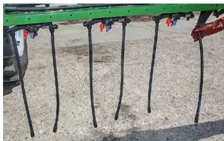
The nozzle holders with extension kit for 25cm spacings are controlled individually and can be fitted with drag hoses.

comprehensive package can be extended even more by upgrading to the Comfort Pack Plus featuring an electric valve on the suction side, a 7in display screen and a hydraulically powered clean water pump as an option. This allows operators to rinse the induction hopper automatically.