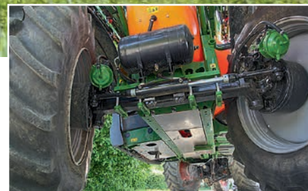
A 2.25m track-width offers enough room for 520/85 R42 rubber and 26° turns. Ground clearance is 0.80m.

So how much is a UX4201 Super going to set you back? In its base spec, you can have this 4,200-litre sprayer for £85,785 but there is a long list of options. The Contour Control for the 27m Super L2 boom is £11,500 and £1,845 for the 25cm nozzle spacing, which is moderate compared to nearly £3,130 for the Comfort Pack. Add to this the 520 tyres (£3,640), the GPS section control including receiver (£2,950) and the full package of nozzles including drag