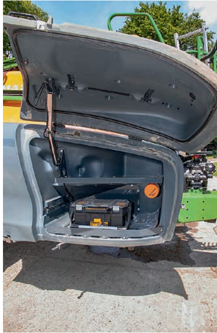
The locker is huge and dust proof with the option of lighting. Excellent.

1) Manufacturer information, 2) Main tank and clean water tank filled