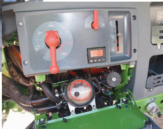
The Comfort Pack buys an electric suction tap with neighbouring LCD Display. The selector valve on the pressure side is still operated manually.