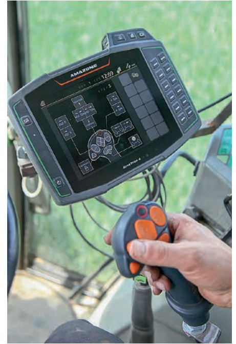
Joystick controls are customisable. We'll discuss the AmaTron4 terminal in our next issue.

This is not an issue if you opt for the AmaSelect selectable nozzles which also come with individual lights for each nozzle. The price for this level of spec adds another £10,035. But for those who want it there is even more tech available. The AmaSpot