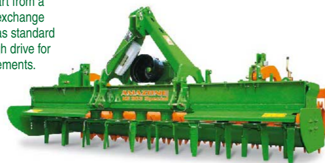
New rotary harrow AMAZONE KE Special

In this way the world-wide success of the AMAZONE KE can continue.