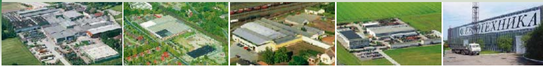
Gaste Hude Forbach Leipzig Samara

Magazine from AMAZONEN-WERKE H. Dreyer for employees, customers and friends of our house