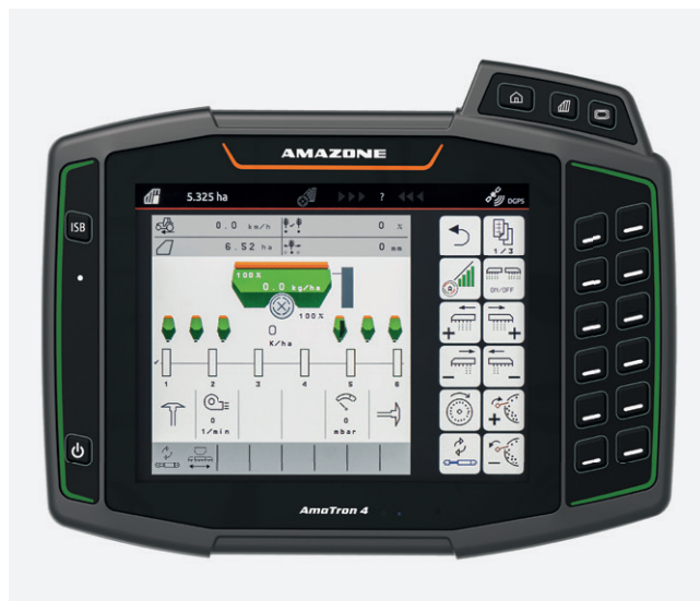
Figure 3: Amazone AmaTron4 was the operator terminal used in the test

In general, the work rate of the seed singling unit is automatically adapted to the forward speed of the tractor. This information is supplied either by a GPS receiver or a radar speed sensor and supplied to the unit via the ISOBUS.