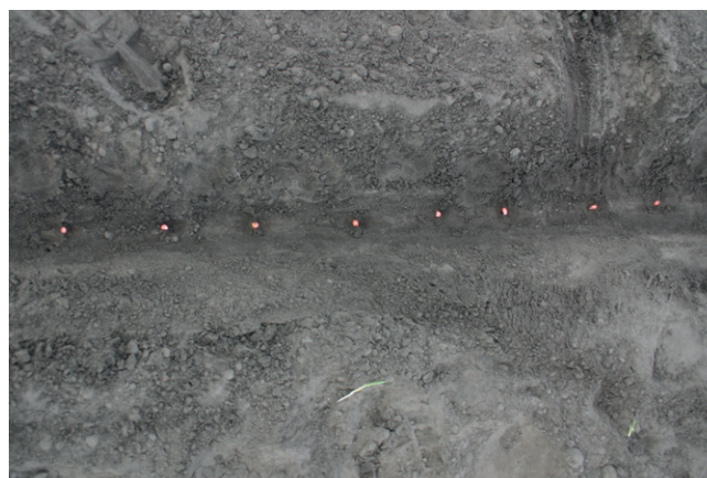
Figure 6: Uncovered Bravissimo seeds drilled at 12 km/h