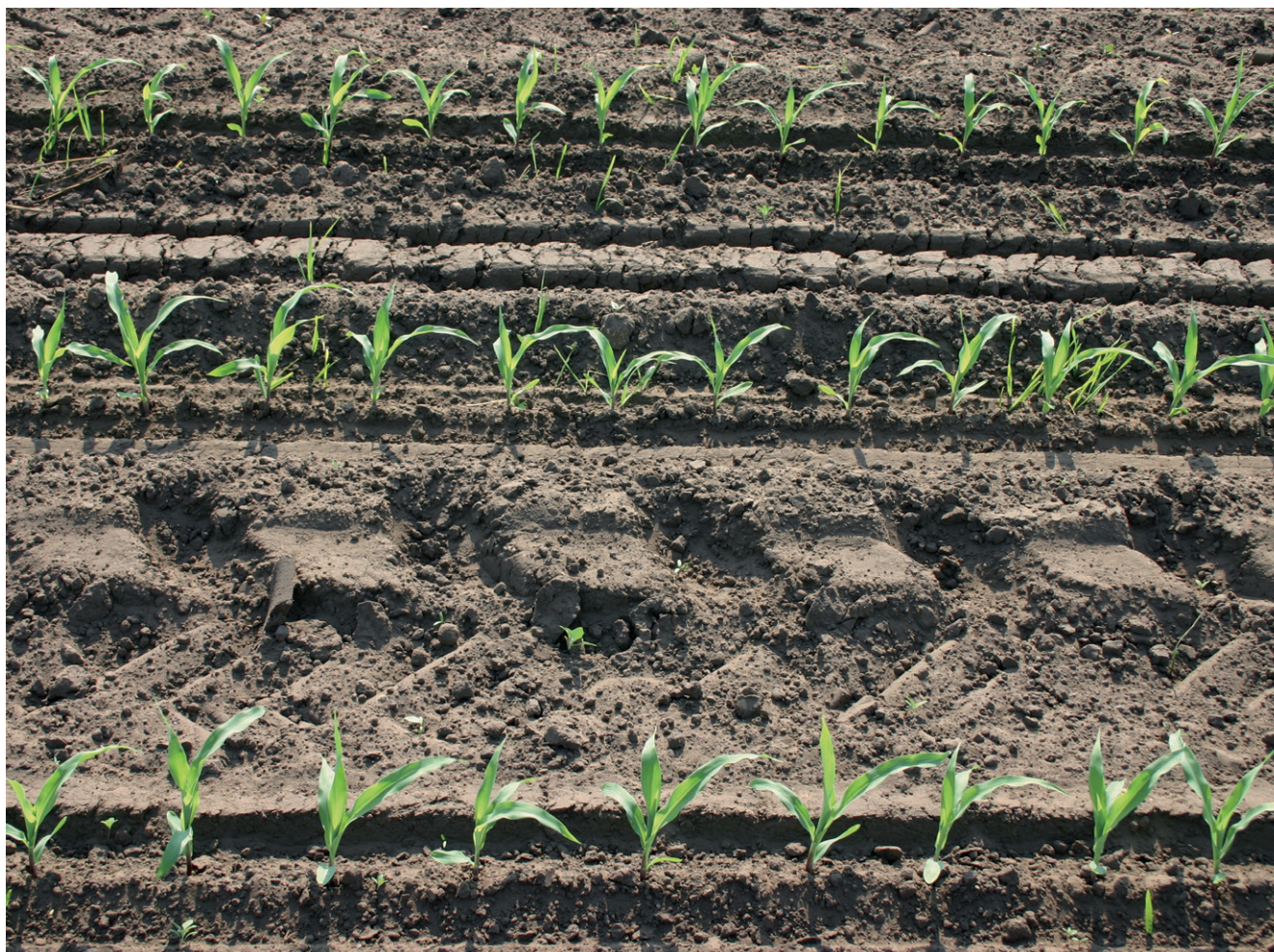
Figure 8: Young Bravissimo plants drilled at 12 km/h on 11 August 2020

All three maize varieties were also field tested at a work rate of 15 km/h. In these tests, the standard deviation was 27.26mm, the percentage of doubles 0.7 %, that of gaps 4.8 % and the emergence rate was 95.4 % for Chiller. For Bravissimo, the standard deviation was 25.51 mm, the percentage of doubles was 1.0 %, the percentage of gaps 3.7 % and the emergence rate was 95.8 %. For Damario, the standard deviation was 28.55 mm, the percentage of doubles 2.6 % and the percentage of gaps 3.8 % and the field emergence rate was 95.9 %.