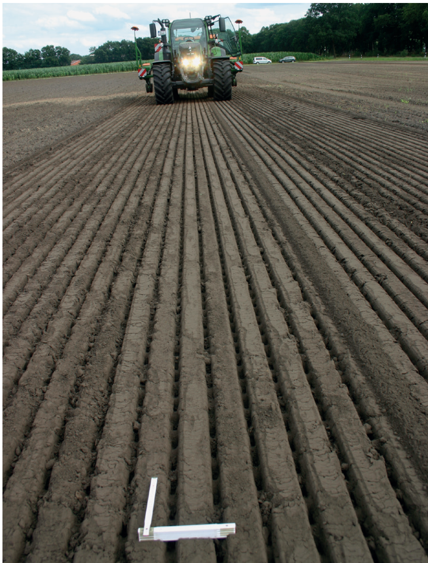
Figure 5: The seedbed into which the crops were drilled

The percentages of target spacings were 93.2 % and 97.5 % in the test. (The percentages of doubles and gaps in the field are never assessed in a DLG field test.) The percentages of doubles in this test were between 0.3 % and 2.2 %. The percentages of gaps were 1.9 % and 5.1 % across all test runs (table 4). The Bravissimo and Damario maize varieties show that the percentages of gaps increased as forward speed increased.